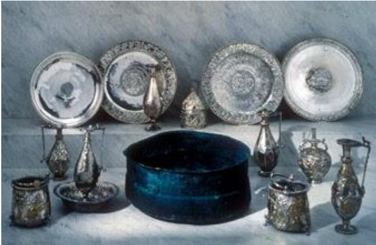
The Sevso treasure